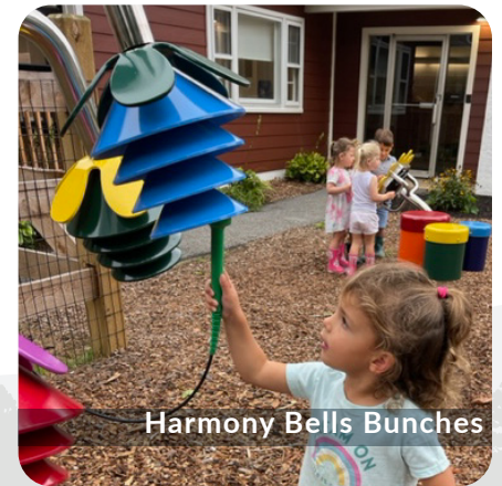
Harmony Bells Bunches