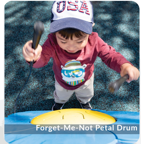
Forget-Me-Not Petal Drum