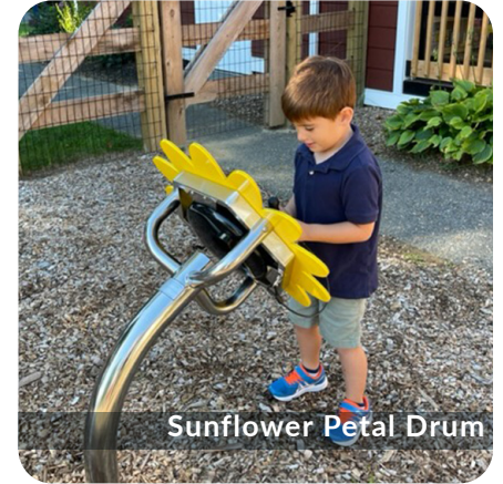
Sunflower Petal Drum